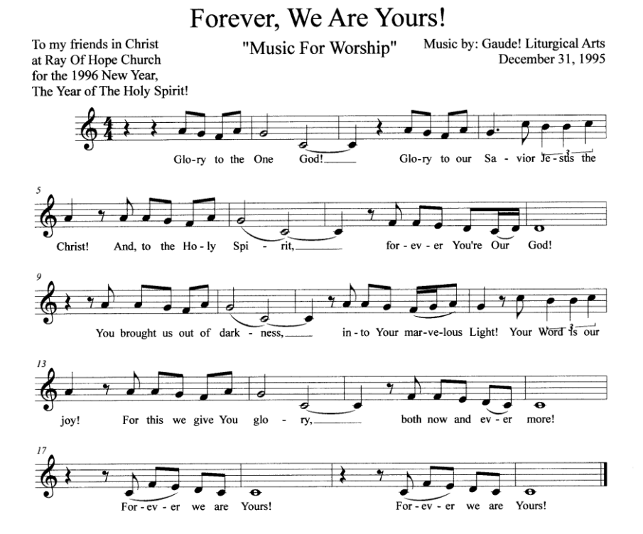
©1993 by Gaude! Liturgical Arts. All Rights Reserved. International Copyright Secured. Reprinted here under CCLI#706121